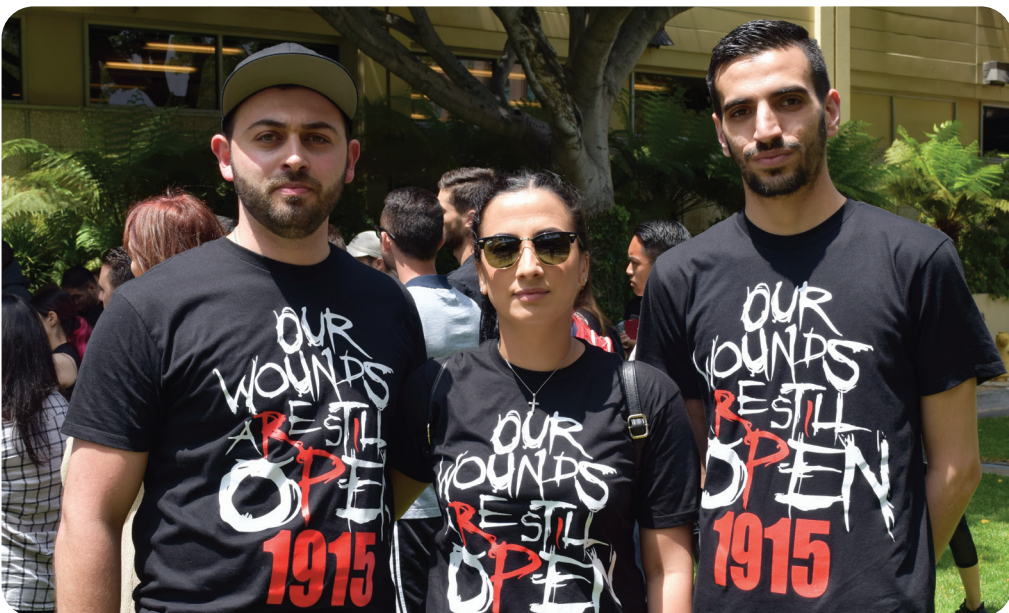
Students at the annual Armenian Genocide Remembrance.