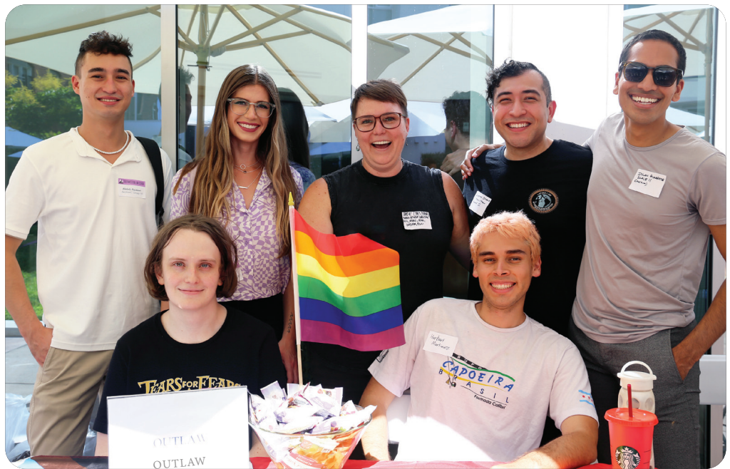
OUTLaw Board Members with students at the SBA Club Fair.