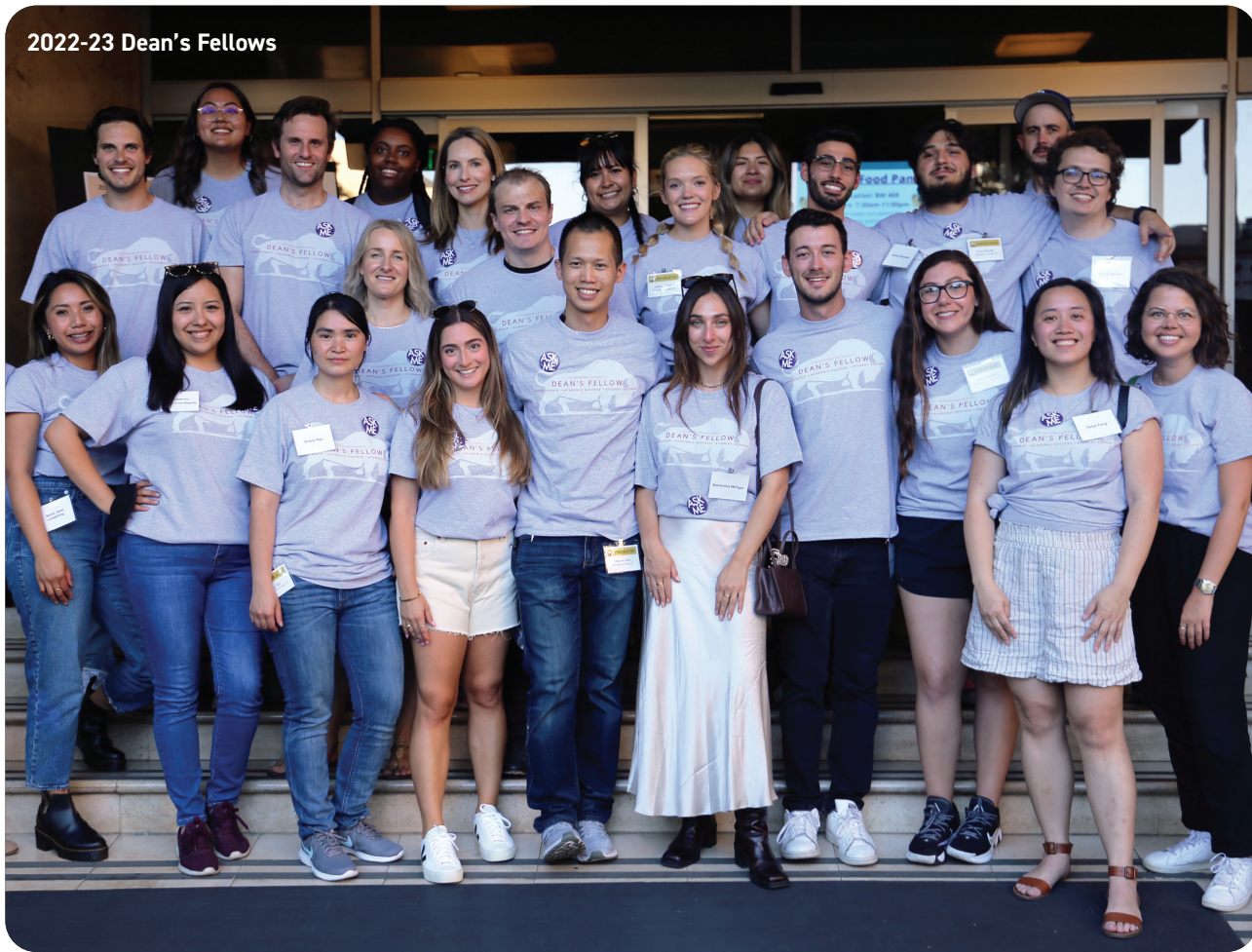
2022-23 Dean's Fellows