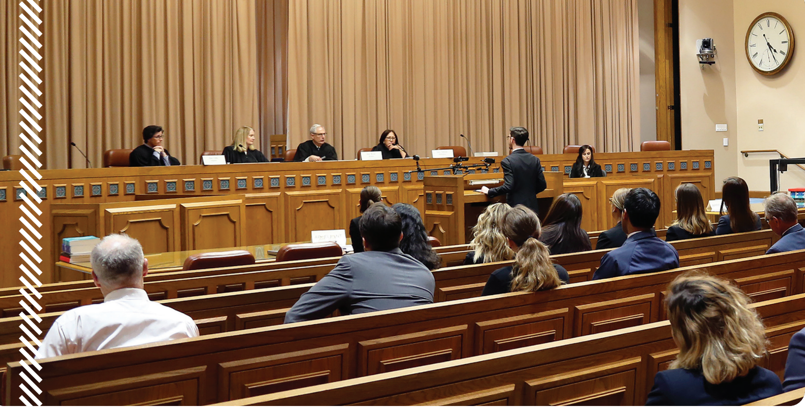
Finalists in the 1L Intramural Moot Court Competition at the U.S. Court of Appeals for the Ninth Circuit in Pasadena, CA.