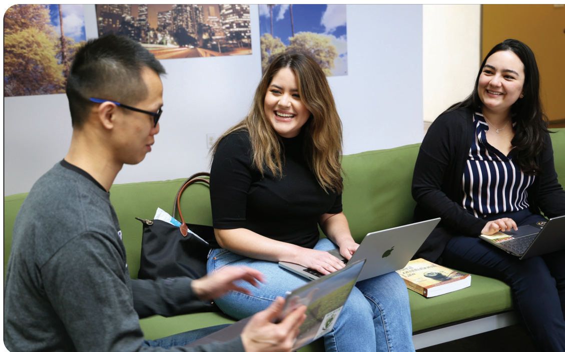
Group study session in one of the student lounges at The Residences @7th.