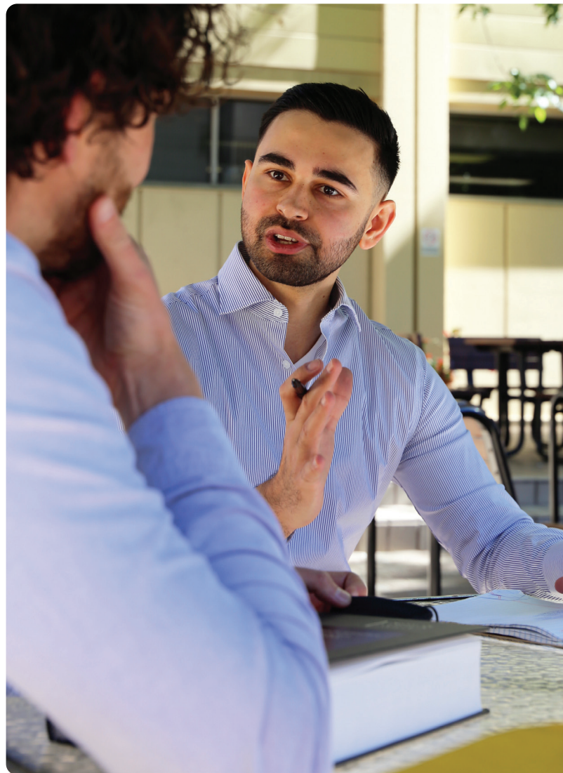
Accelerated J.D. (SCALE) students discussing their externships.