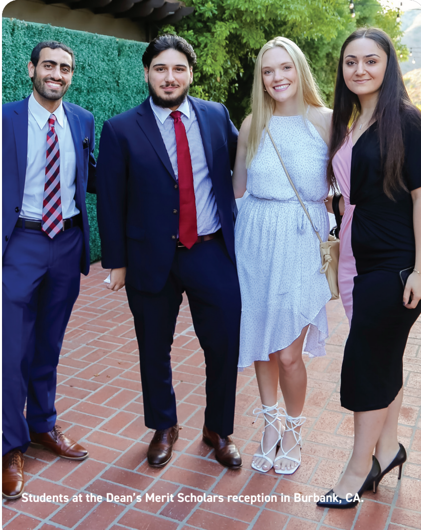
Students at the Dean's Merit Scholars reception in Burbank, CA.