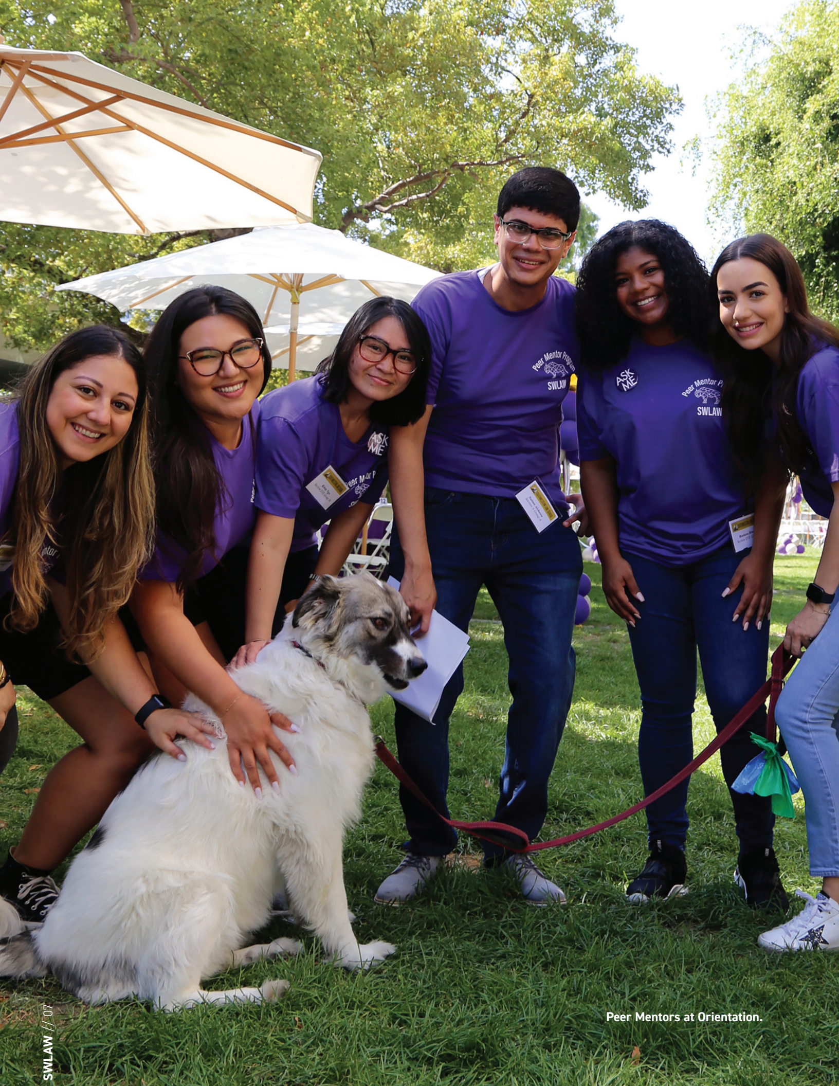
Peer Mentors at Orientation.