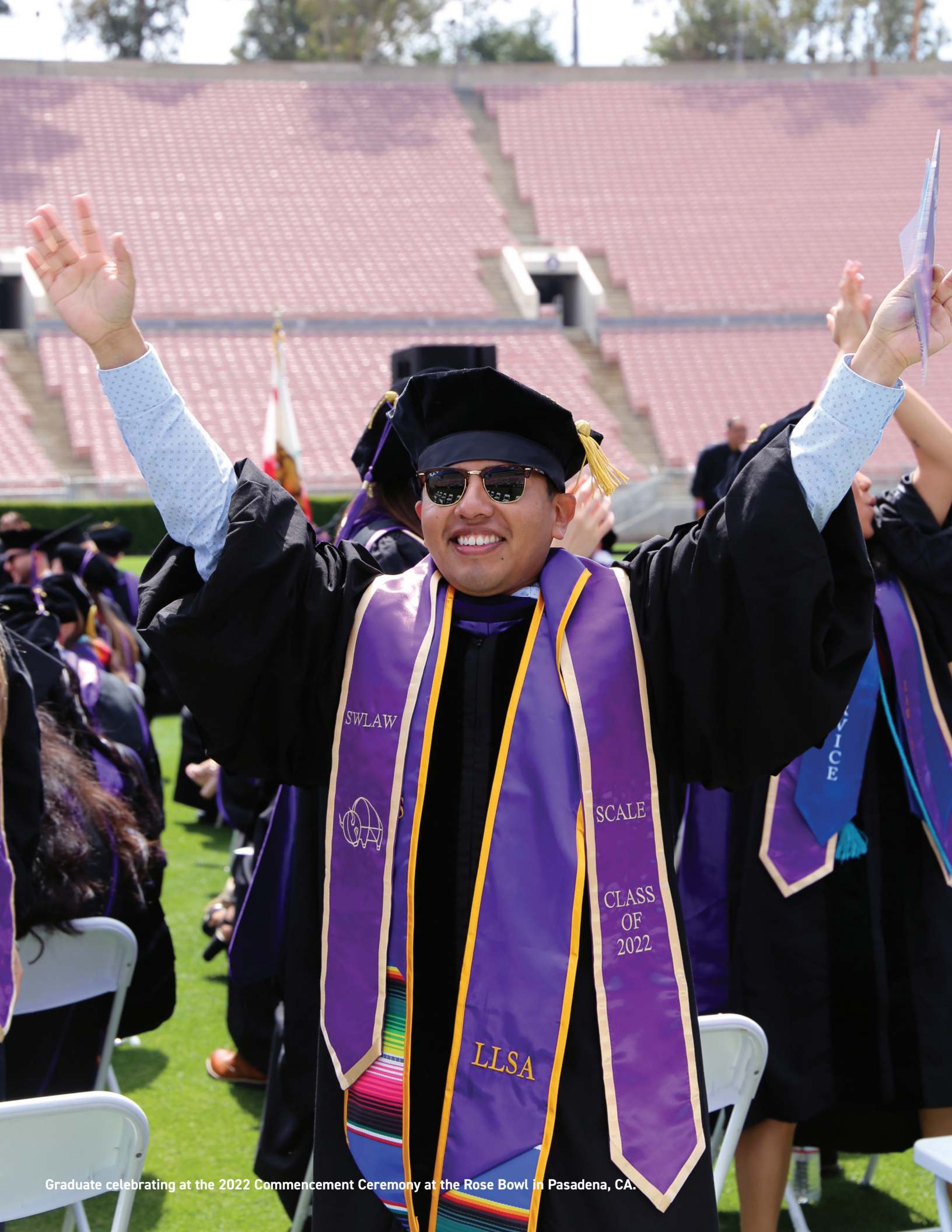
Graduate celebrating at the 2022 Commencement Ceremony at the Rose Bowl in Pasadena, CA.