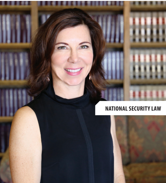
NATIONAL SECURITY LAW