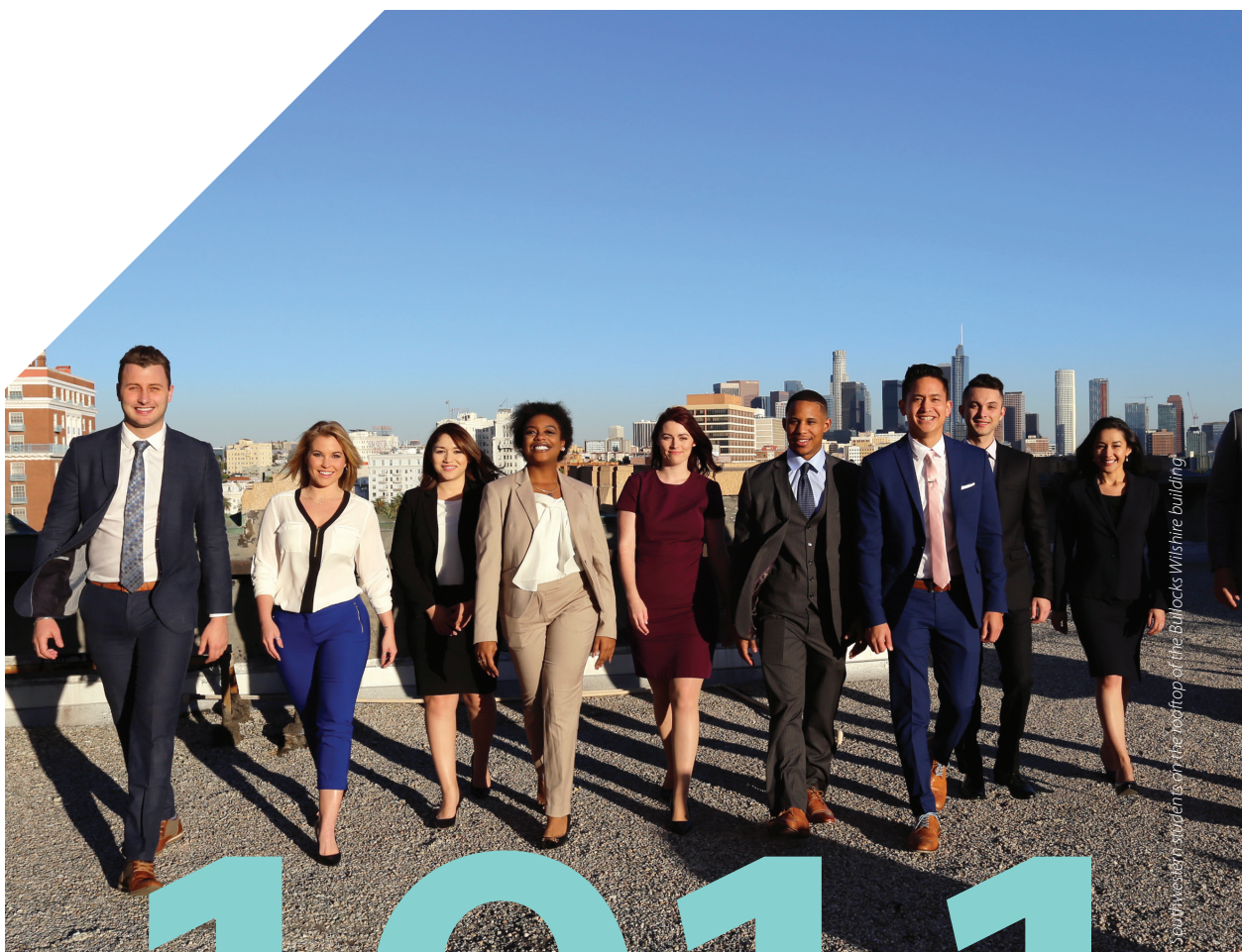
Southwestern students on the rooftop of the Bullocks Wilshire building