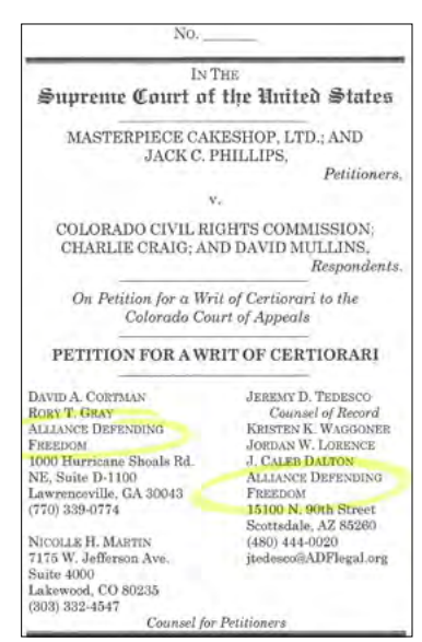
First Page of Petition by Alliance Defending Freedom

The website, which has a tab for monetary donations, makes