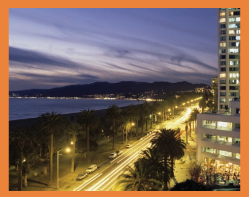
(TOP) Museum of Contemporary Art, Grauman's Chinese Theatre (both ©LA INC/LACVB) - (CENTER) Surfer at Venice Beach (©Robert Caudillo/ California Stock Photo), LA County Museum of Art (©Ambient Images) - (BOTTOM) Staples Center, Pacific Palisades (both ©LA INC/LACVB)