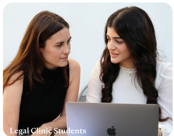
Legal Clinic Students