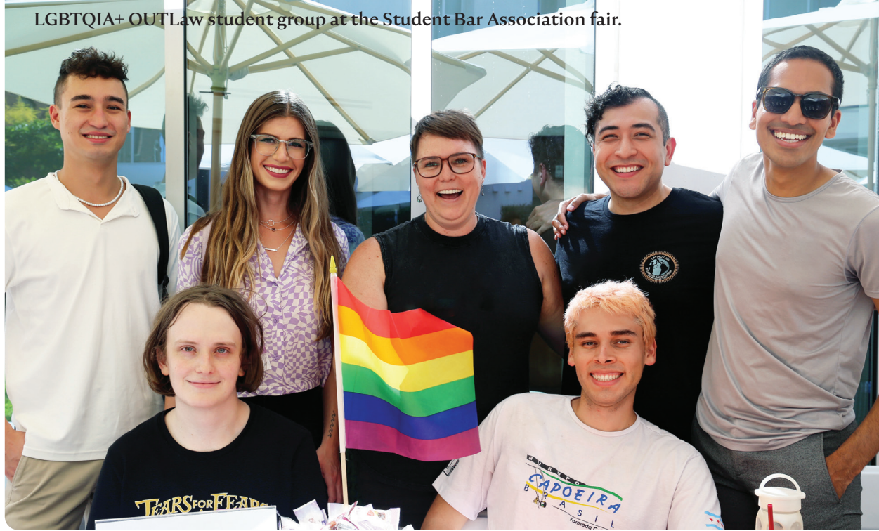
LGBTQIA+ OUTLaw student group at the Student Bar Association fair.