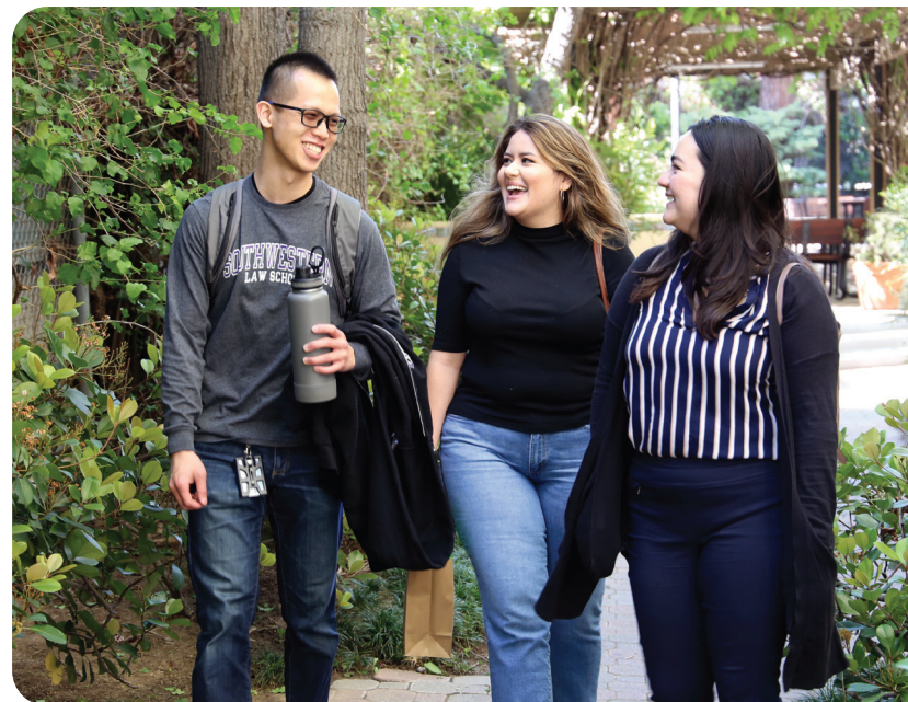
From left to right: students at the JHP Public-Service Awards Luncheon; students walking to on-campus housing, the Residences at 7th.