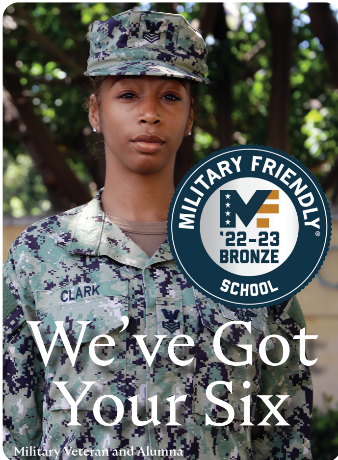
Military Veteran and Alumna