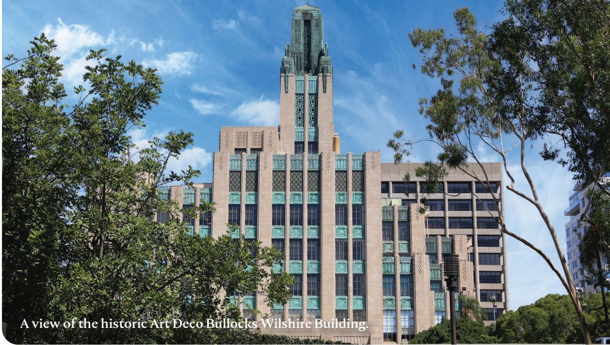
A view of the historic Art Deco Bullocks Wilshire Building.