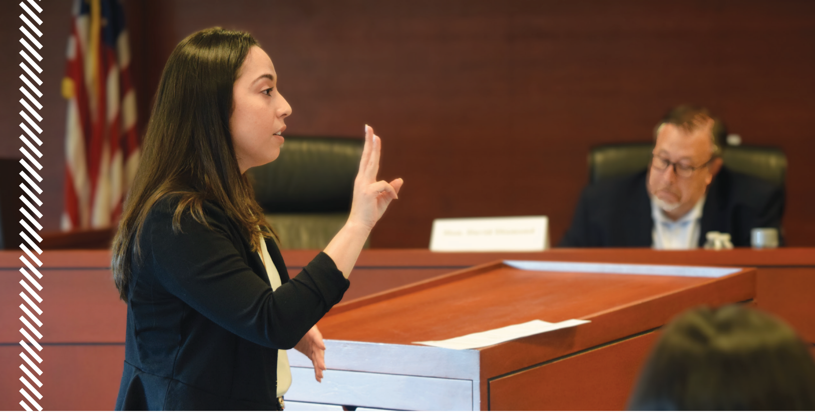
Finalist in the 2023 Joseph Esposito & Bill Seki Trial Advocacy Honors Program Competition.