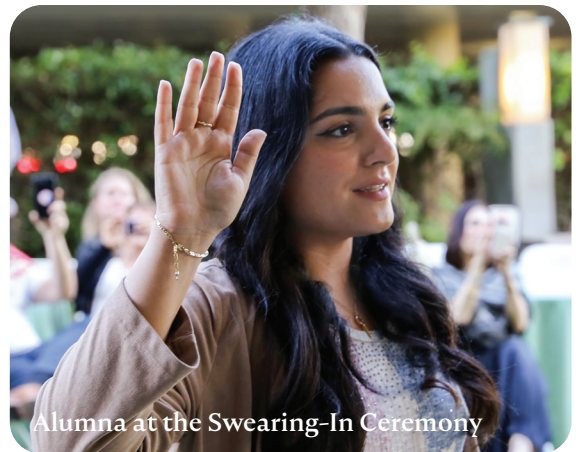
Alumna at the Swearing-In Ceremony