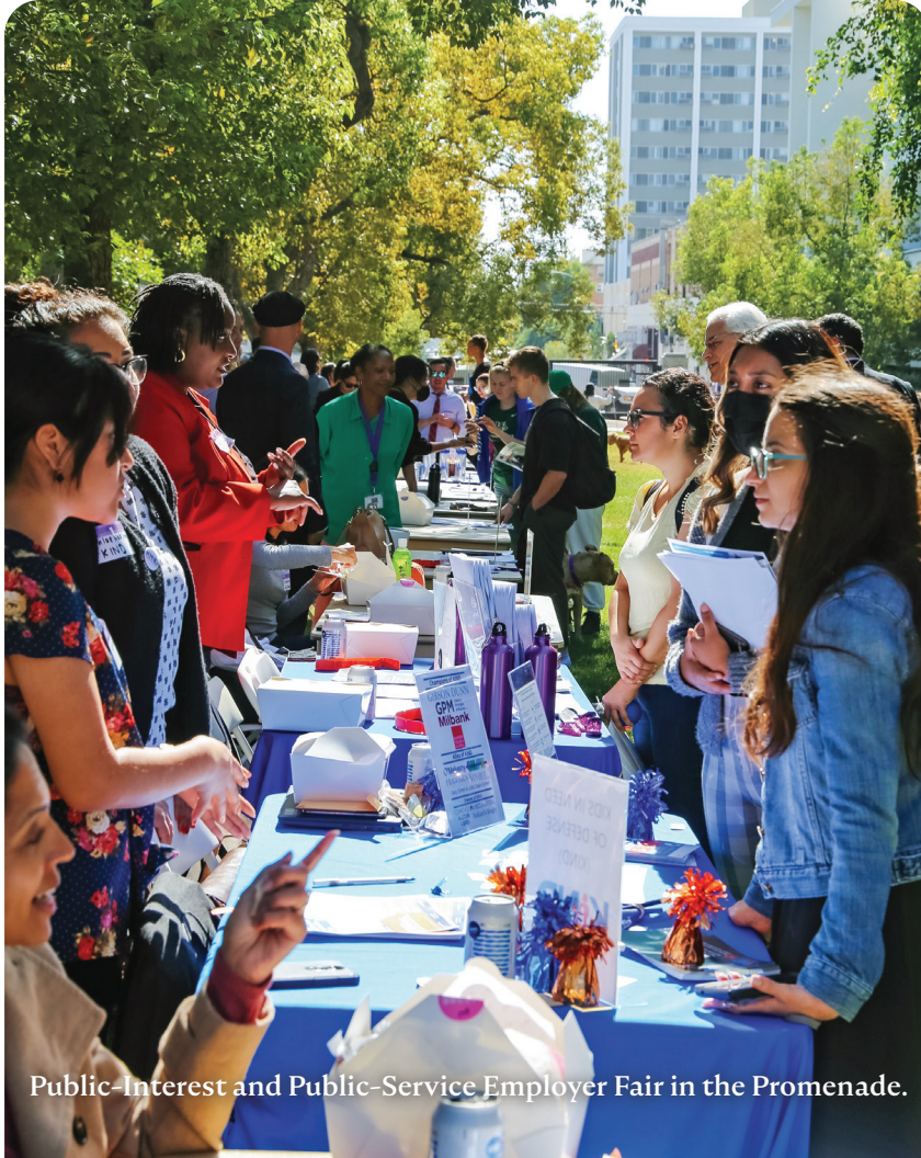
Public-Interest and Public-Service Employer Fair in the Promenade.