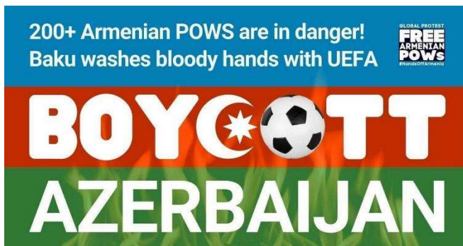
Source: Global Network to Free Armenian POWs redoubling boycott efforts against Azerbaijan for EURO 2020. The Armenian Weekly Newspaper. June 30, 2021

https://orer.eu/en/allcategories-en-gb/72-hy-am/6198-azerbaijan-hate-speech-precarious-situation-of-civil-society-violence-against-lgbt-are-issues-of-high-concern-says-council-of-europes-anti-racism-commission.html