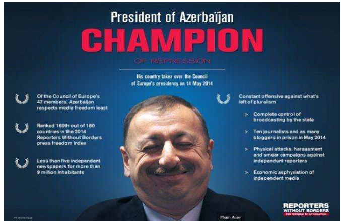
Source: Azerbaijan: hate speech, precarious situation of civil society, violence against LGBT are issues of high concern, says Council of Europe's Anti-racism Commission . Ozer Newspaper.

https://orer.eu/en/allcategories-en-gb/72-hy-am/6198-azerbaijan-hate-speech-precarious-situation-of-civil-society-violence-against-lgbt-are-issues-of-high-concern-says-council-of-europes-anti-racism-commission.html